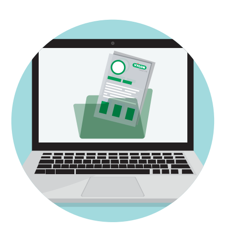
Product support and information