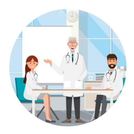
Clinical education and training

Introducing a healthcare portal to support both clinical and non-clinical staff with online education, training and a wealth of tools and resources.