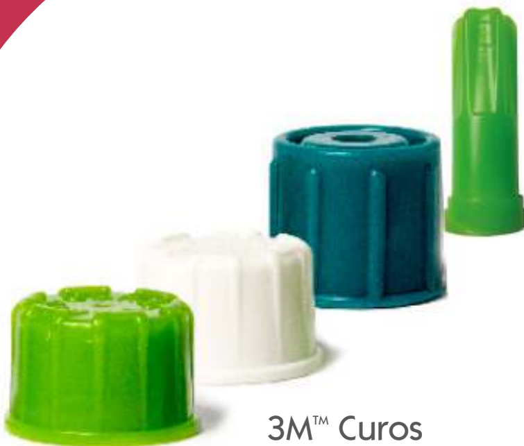
3M™ Curois Disinfecting Port Protector Range