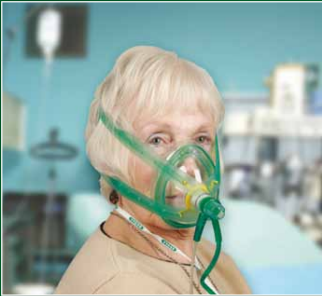
Boussignac CPAP Set-up

equipment to undergo a more complex set-up or calibration procedures prior to receiving treatment. In my opinion this has meant more rapid improvement in their symptoms. Some patients with severe shortness of breath have improved so quickly with CPAP that they no longer require nitrate infusions or Coronary Care Unit admission.